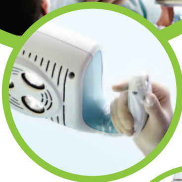
Disposable Sheath Available—Part #52630