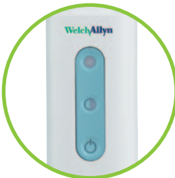
Touchless On/Off with Dimming Control