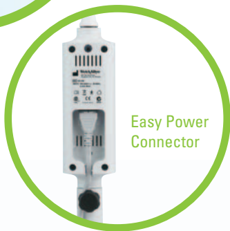
Easy Power Connector